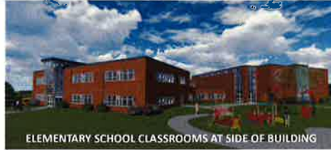
ELEMENTARY SCHOOL CLASSROOMS AT SIDE OF BUILDING