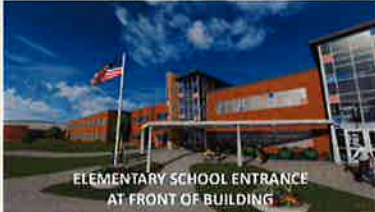
ELEMENTARY SCHOOL ENTRANCE AT FRONT OF BUILDING

NOTE: These are concept drawings for the elementary addition and may be changed in final design.